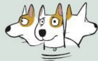
Hypervigilant looking in many directions