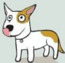
Licking Lips when no food nearby