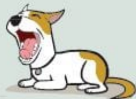
Acting Sleepy or Yawning when they shouldn't be tired