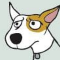
Brows Furrowed, Ears to Side