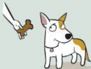
Suddenly Won't Eat but was hungry earlier