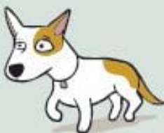
Moving in Slow Motion walking slow on floor