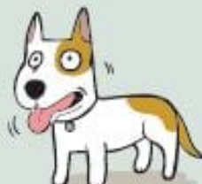
Panting when not hot or thirsty